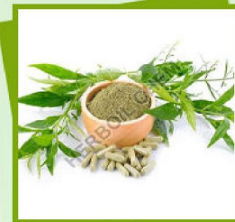
Andrographis Paniculata Extract