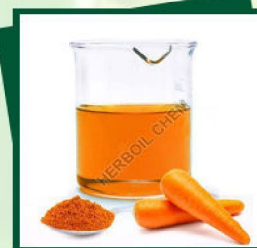
Beta Carotene Color