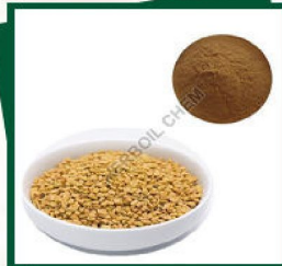
Trigonella Foenum Extract