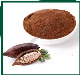
Theobroma Cacao Extract