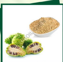
Morinda Citrifolia Extract