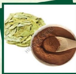
Senna Leaf Extract