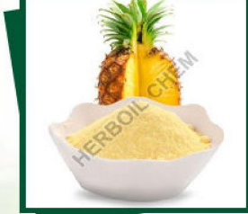
Bromelain Enzyme Powder