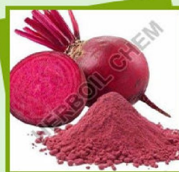
Beet Root Juice Powder