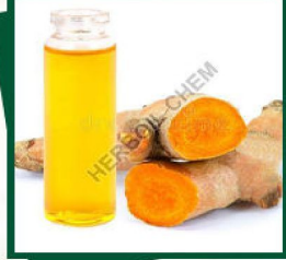
Nano Curcumin 5% to 20% Liquid Water Soluble