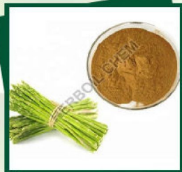
Asparagus Racemosus Extract