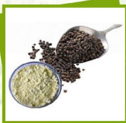
Piper Nigrum Extract