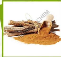
Glycyrrhiza Glabra Extract