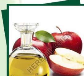
Apple Seed Oil