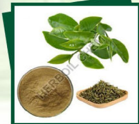
Camellia Sinensis Extract