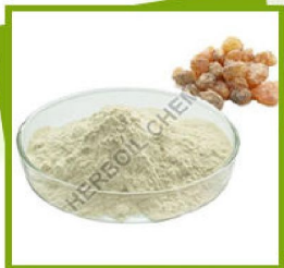
BOSWELLIA SERRATA (AKBA 10%-75%)