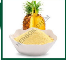
Ananas Comosus Fruit Extract (Bromelain)