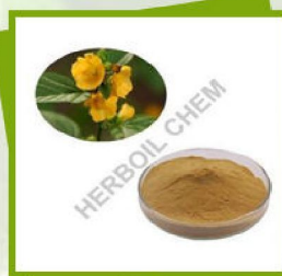
Sida Cordifolia Extract