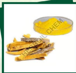
Berberine HCL 98%