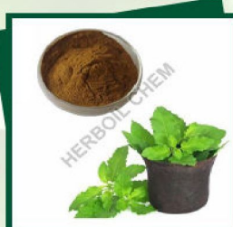
Ocimum Sanctum Extract