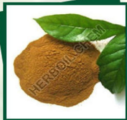
Adhatoda Vasica Leaf Extract