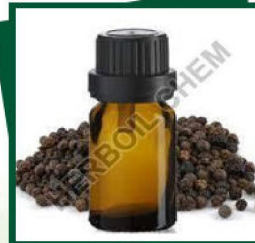
Black Pepper Oleoresin