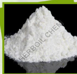
Caffeine Anhydrous 99%