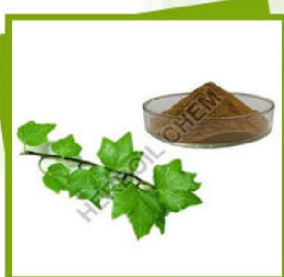
Ivy Leaf Extract