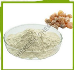
Boswellia Serrata Extract