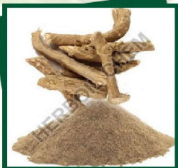
Boerhavia Diffusa Root Extract