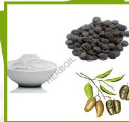
Griffonia Seed Extract 5 HTP