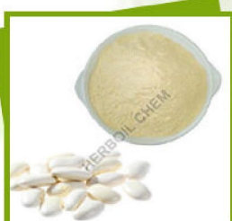
White Kidney Extract