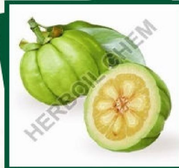
Garcinia Cambogia Extract