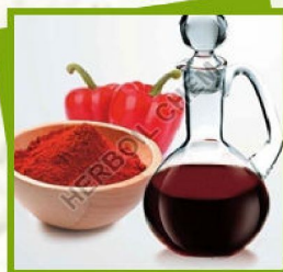
Paprika Food Color