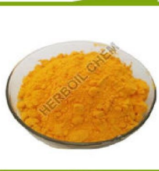
Coenzyme Q10 99% Powder