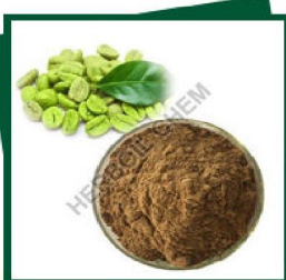
Green Coffee Bean Extract