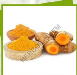
Nano Curcumin Extract