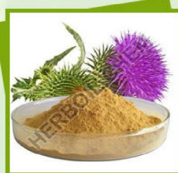
Milk Thistle Extract