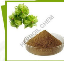
Tribulus Terrestris Extract