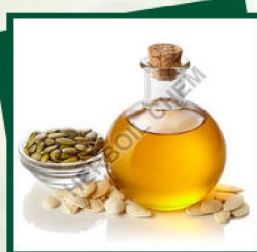
Pumpkin Seed Oil