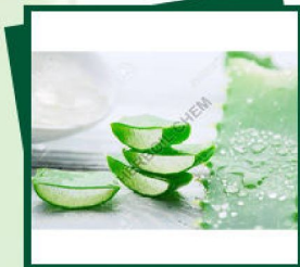
Aloe Vera Extract