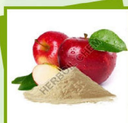
Apple Juice Powder