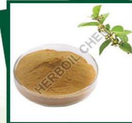
Gymnema Sylvestre Extract