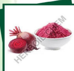
Beet Root Powder