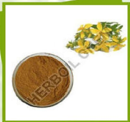
Amaltas Dry Extract