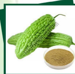
Momordica Charantia Fruit Extract