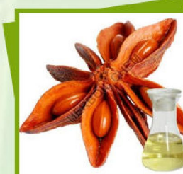
Star Anise Oil