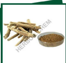
Withania Somnifera Extract