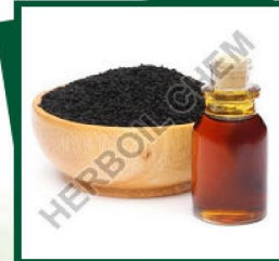
Nigella Sativa Oil