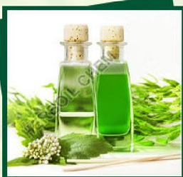
Tea Tree Oil