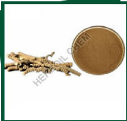
Cephaelis Ipecacuanha Liquid Extract 2%