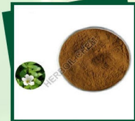
Bacopa Monnieri Extract