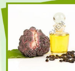
Custard Apple Oil