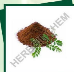
Phyllanthus Niruri Extract