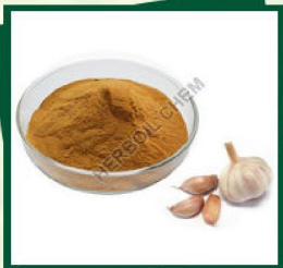
Allium Sativum Extract