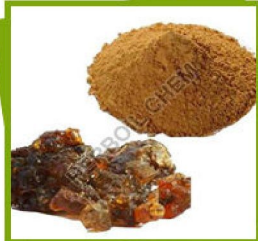
Commiphora Mukul Extract