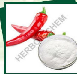
Capsaicin 95% Powder