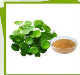
Centella Asiatica Herb Extract