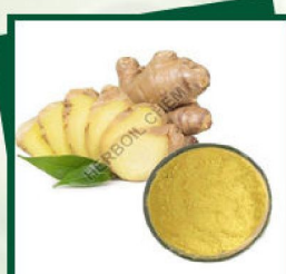
Zingiber Officinale Tuber Extract