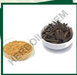
Piper Longum Extract