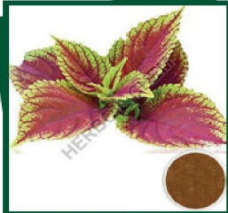
Coleus Forskolin Extract