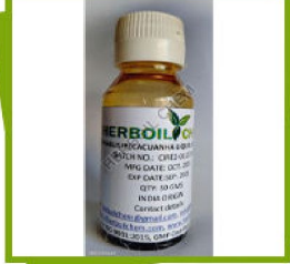
IPECACUANHA LIQUID EXTRACT 2% BP